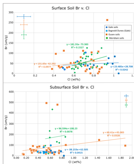
Figure 2. Br vs. Cl scatterplots showing linear best-fit.

more uniform between landing sites and surface versus subsurface soils. This suggests that S and Cl bearing phases (e.g., minerals or amorphous compounds) are more stable in the soil—or reacting similarly to alteration processes—at all locations while Br counterparts are less stable and responding differently to alteration processes.